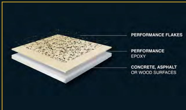
Good System - Flakes included