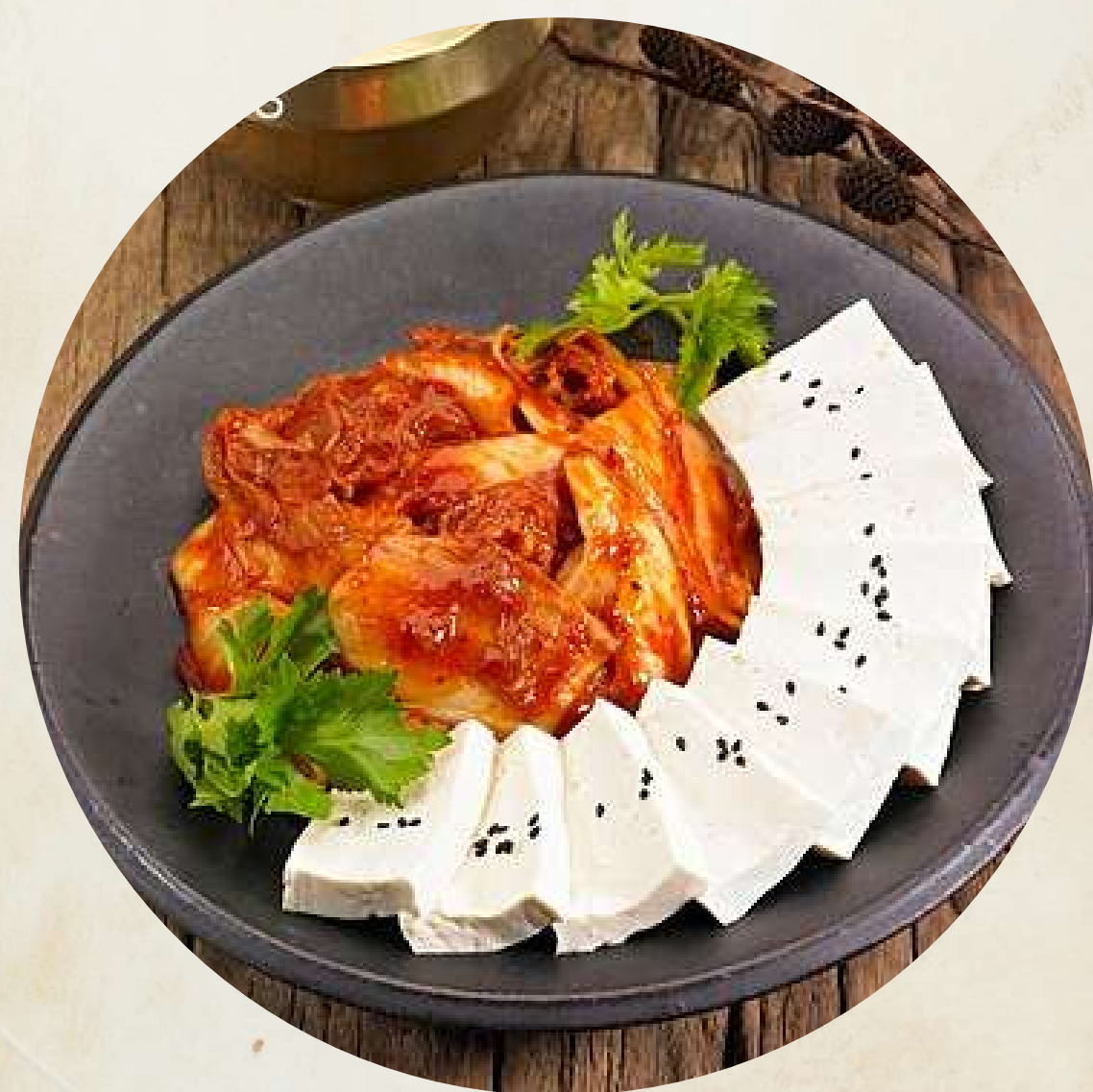
Tofu-kimchi and pork