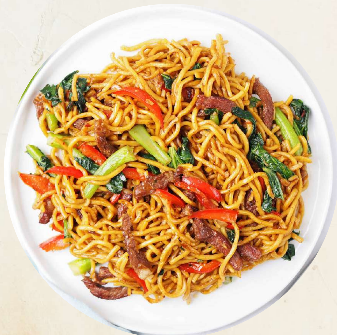
Beef/Pork/Chicken/Shrimp stir fry noodles