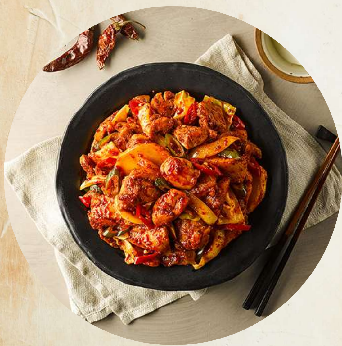
Spicy stir fry chicken