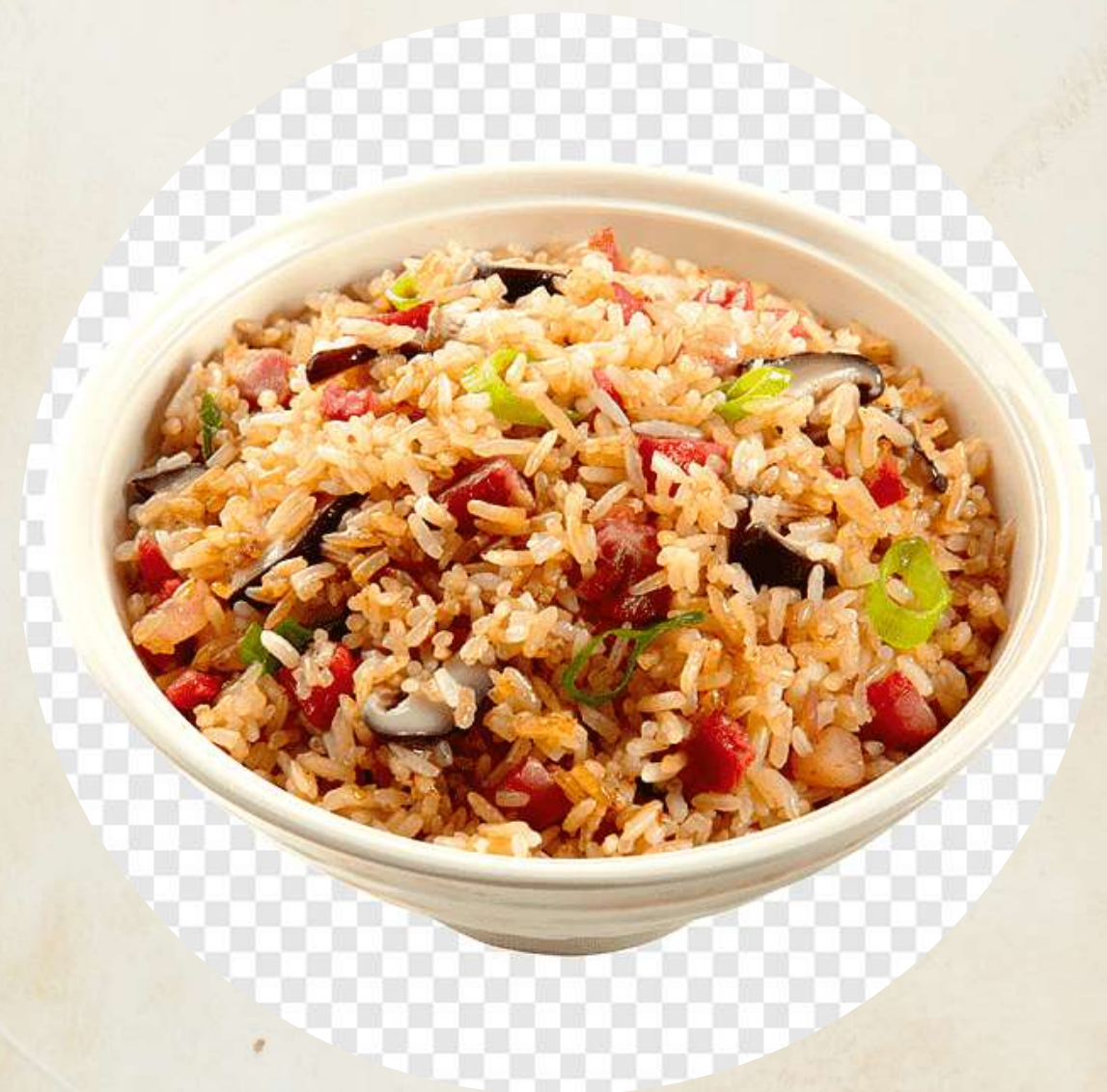
Beef/Pork/chicken fried rice with coriander