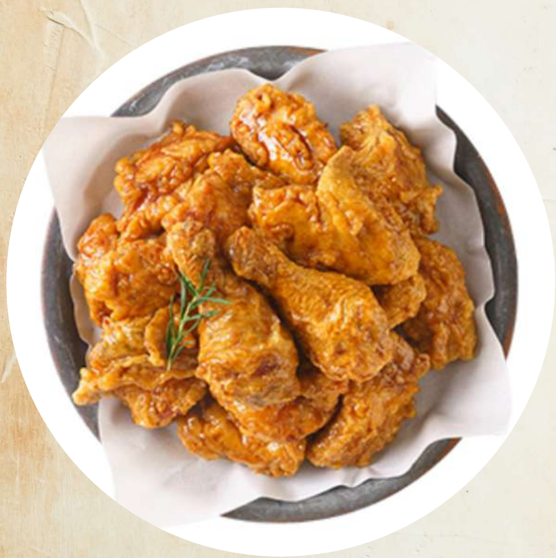
Korean Fried Chicken