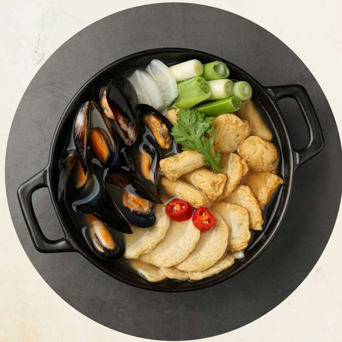
Mussel and fish cake