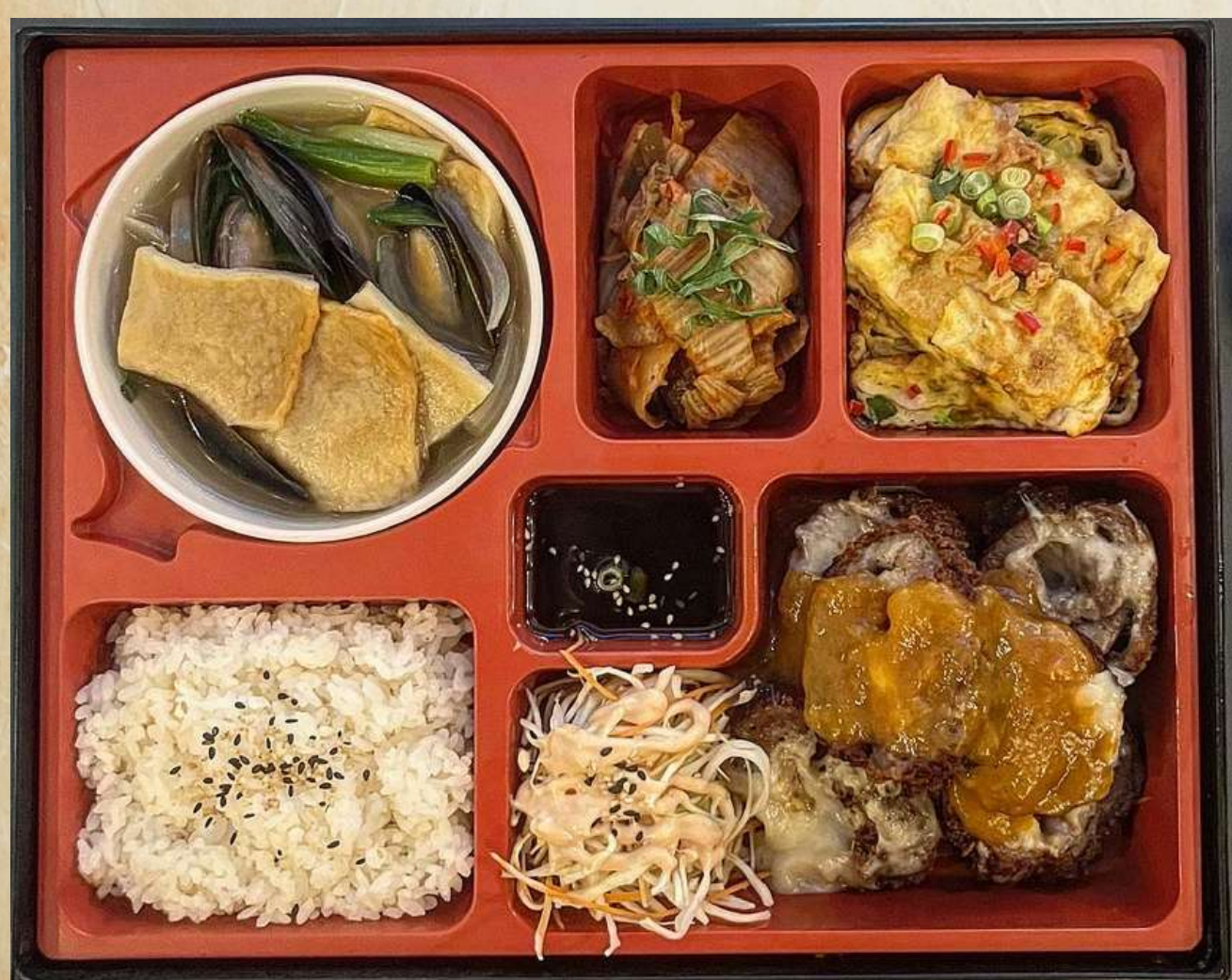
Pork cutlet box