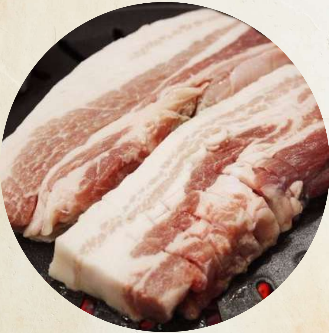
Pork belly BBQ 200g