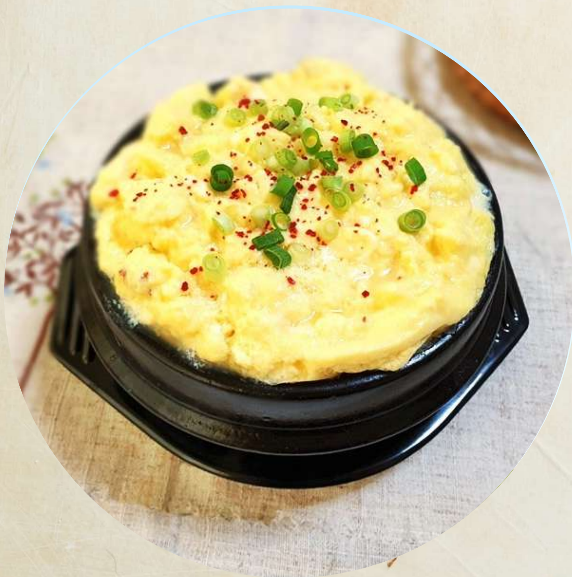
Korean steamed egg