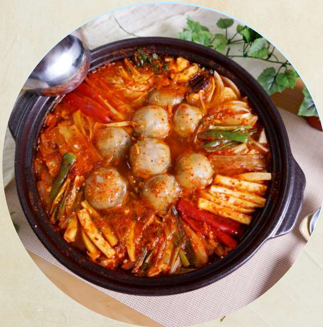
Kimchi dumpling hot pot 김치만두전골