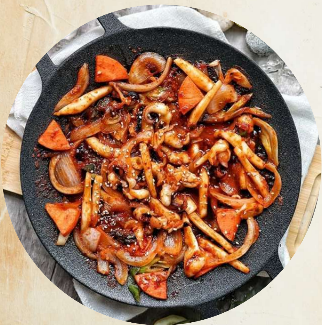
Spicy stir fry squid