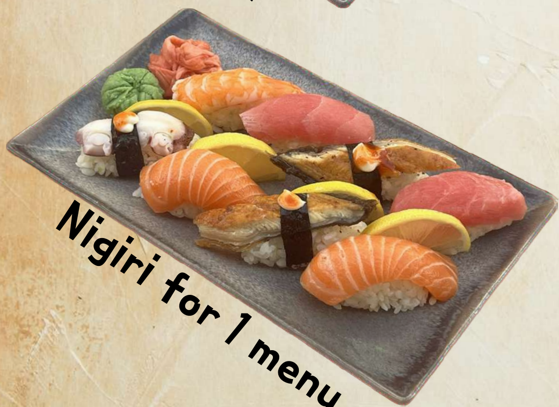
Nigiri for 1 menu