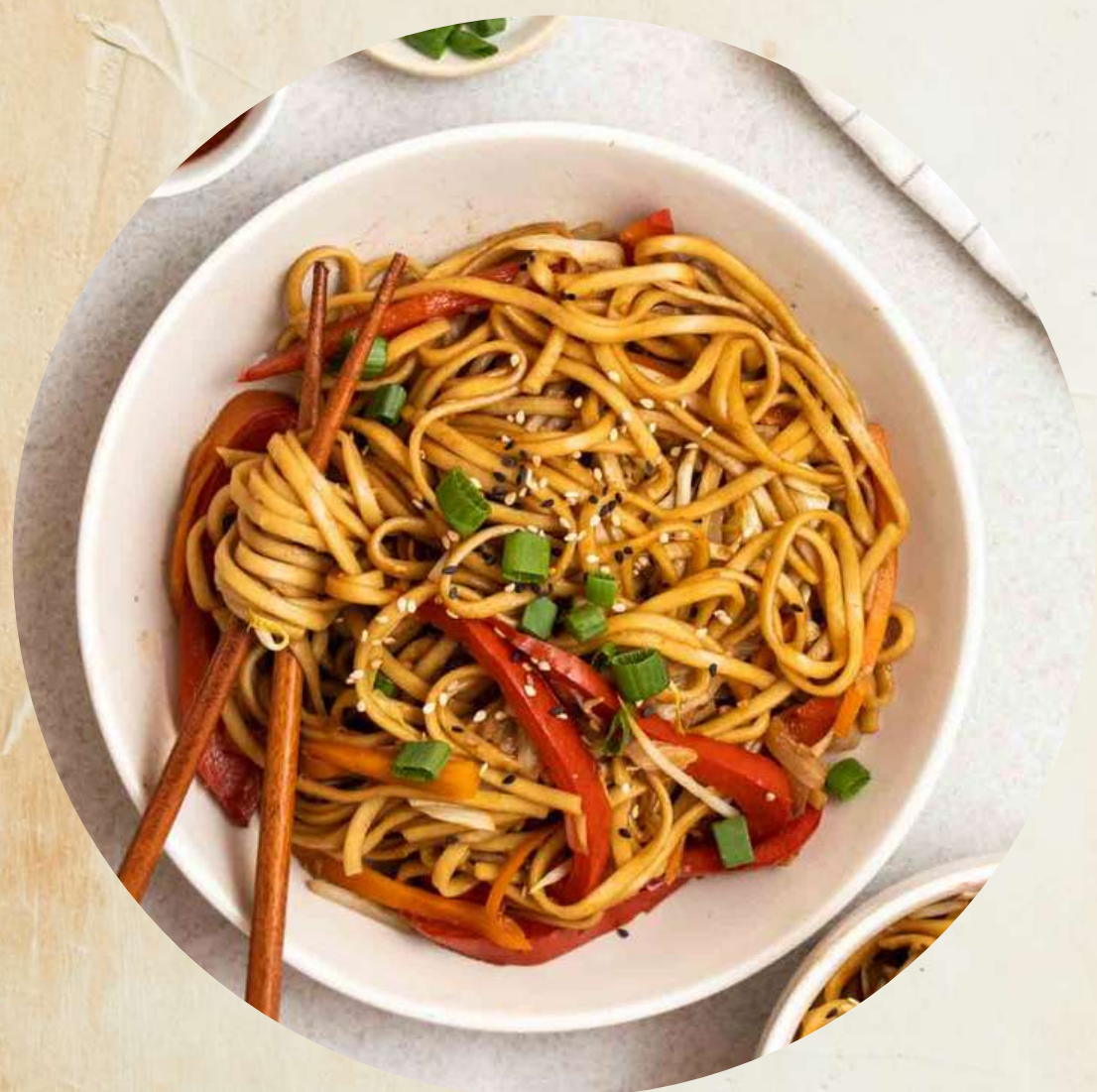
vegetables stir fry noodles