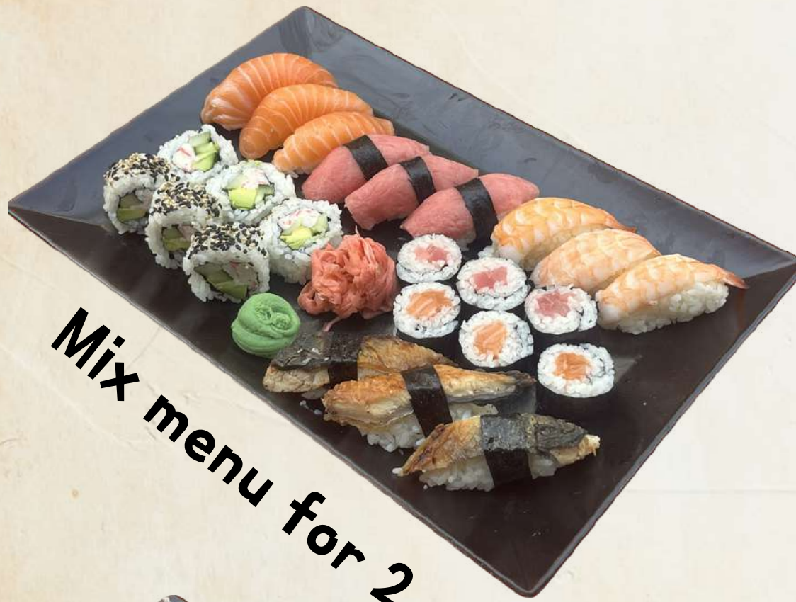
Mix menu for 2