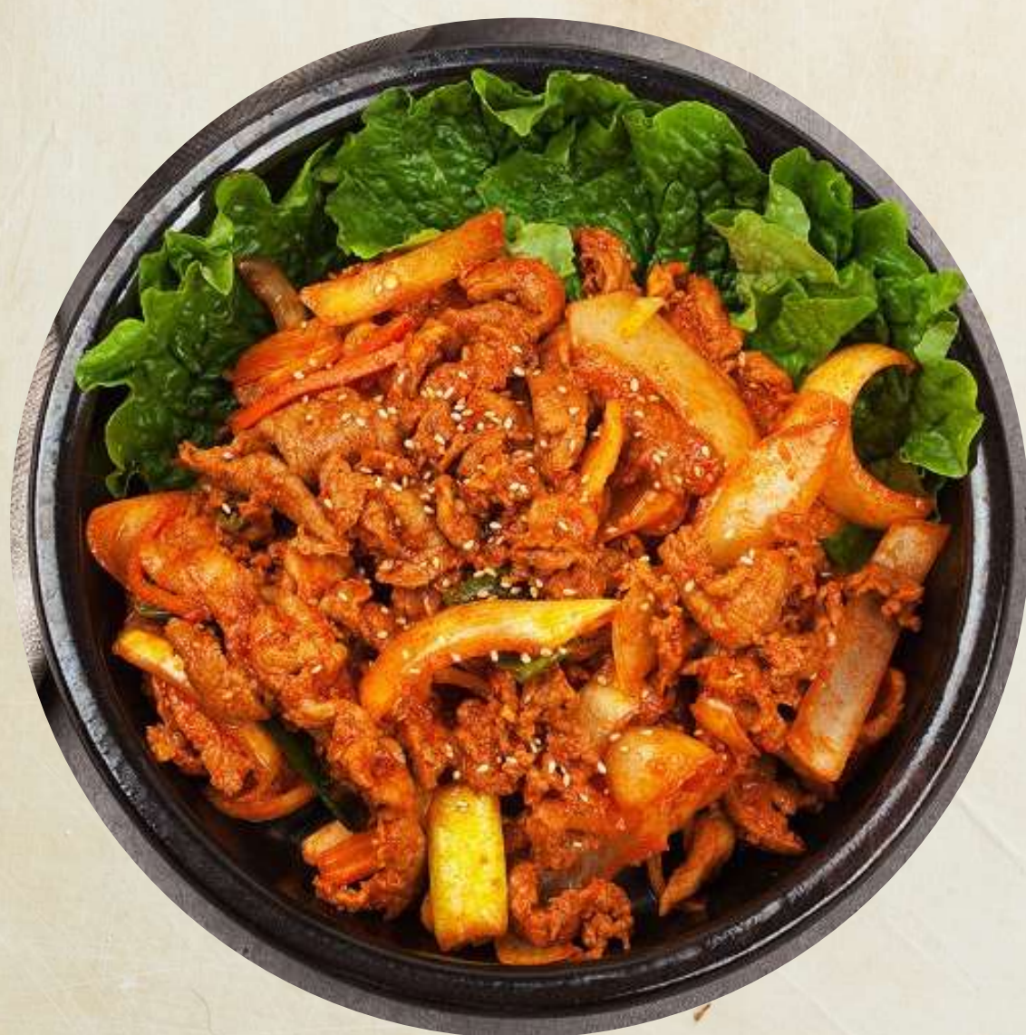
Spicy stir fry pork