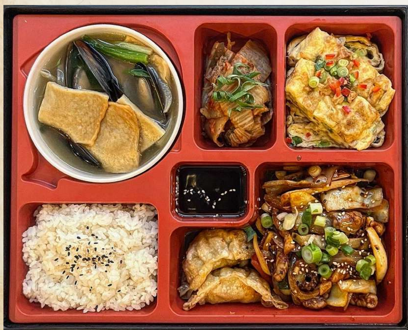
Spicy squid box