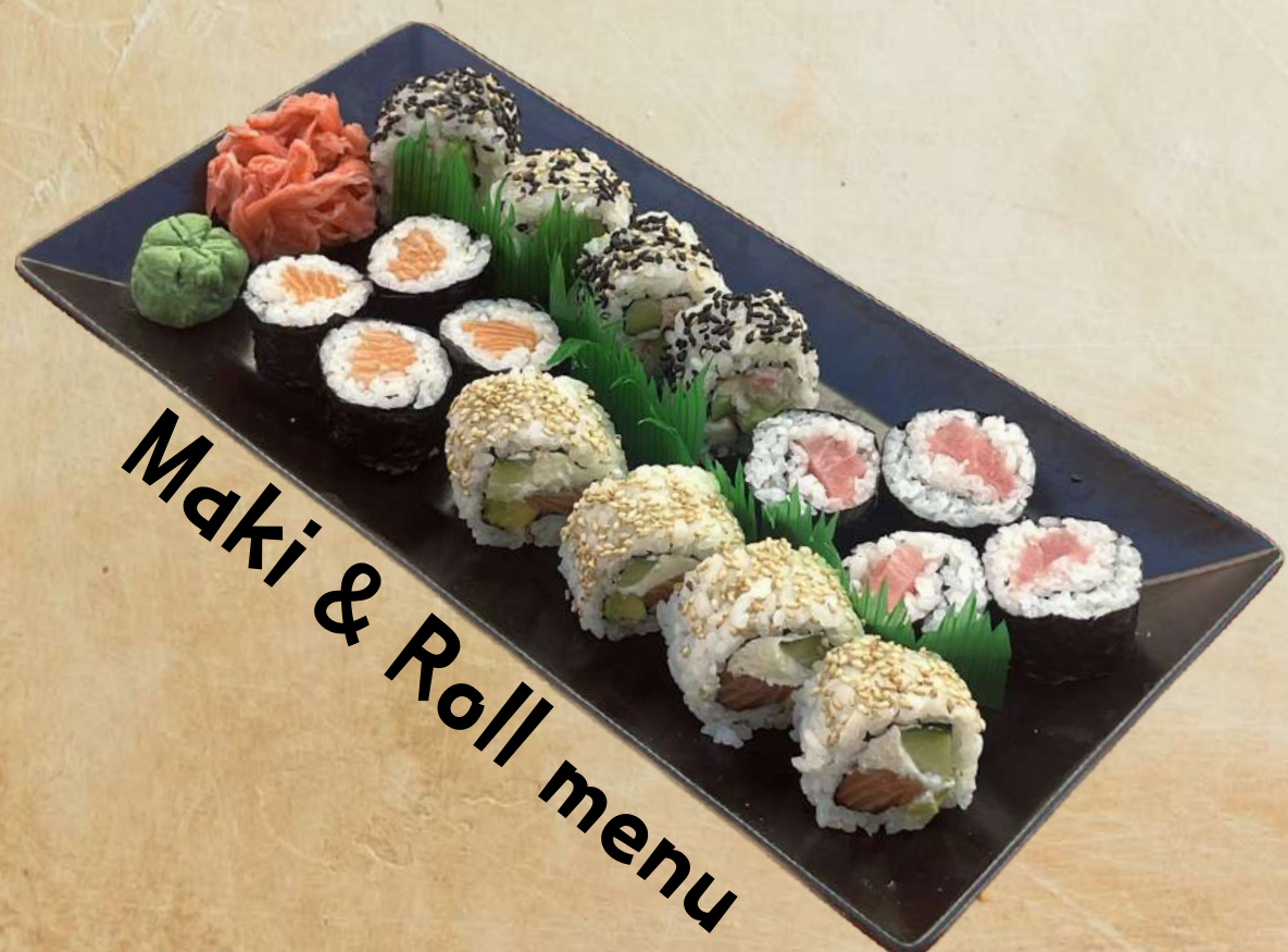
Maki & Roll menu