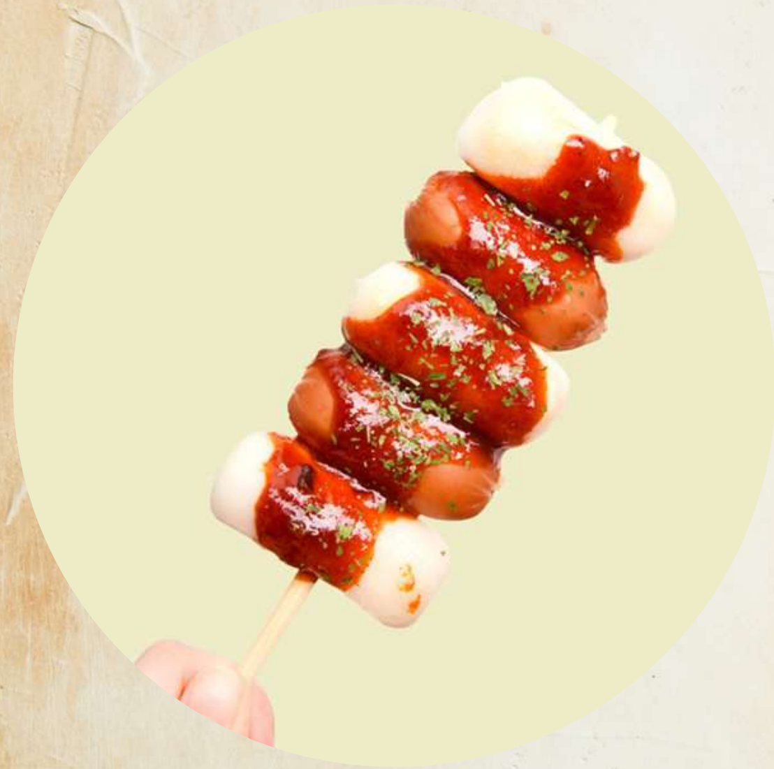
Sotteok (sausage and rice cake)