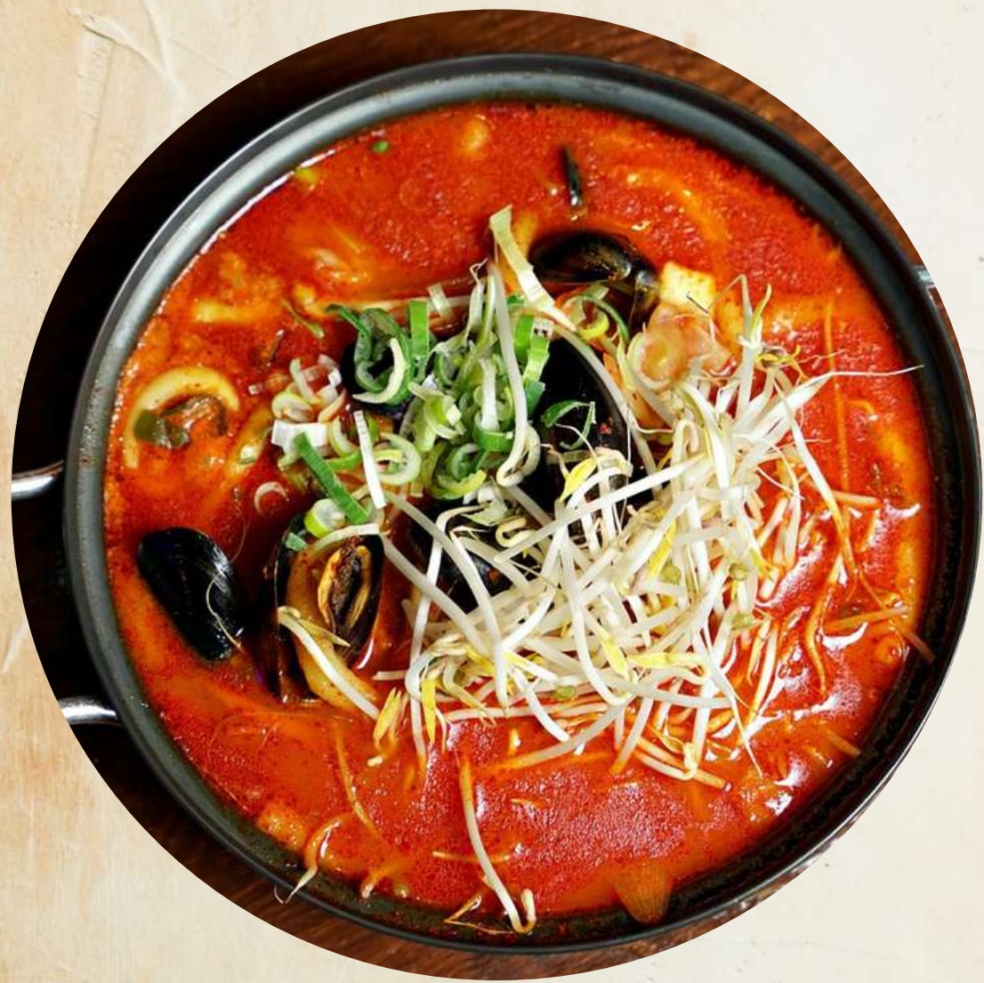
Spicy seafood hot pot