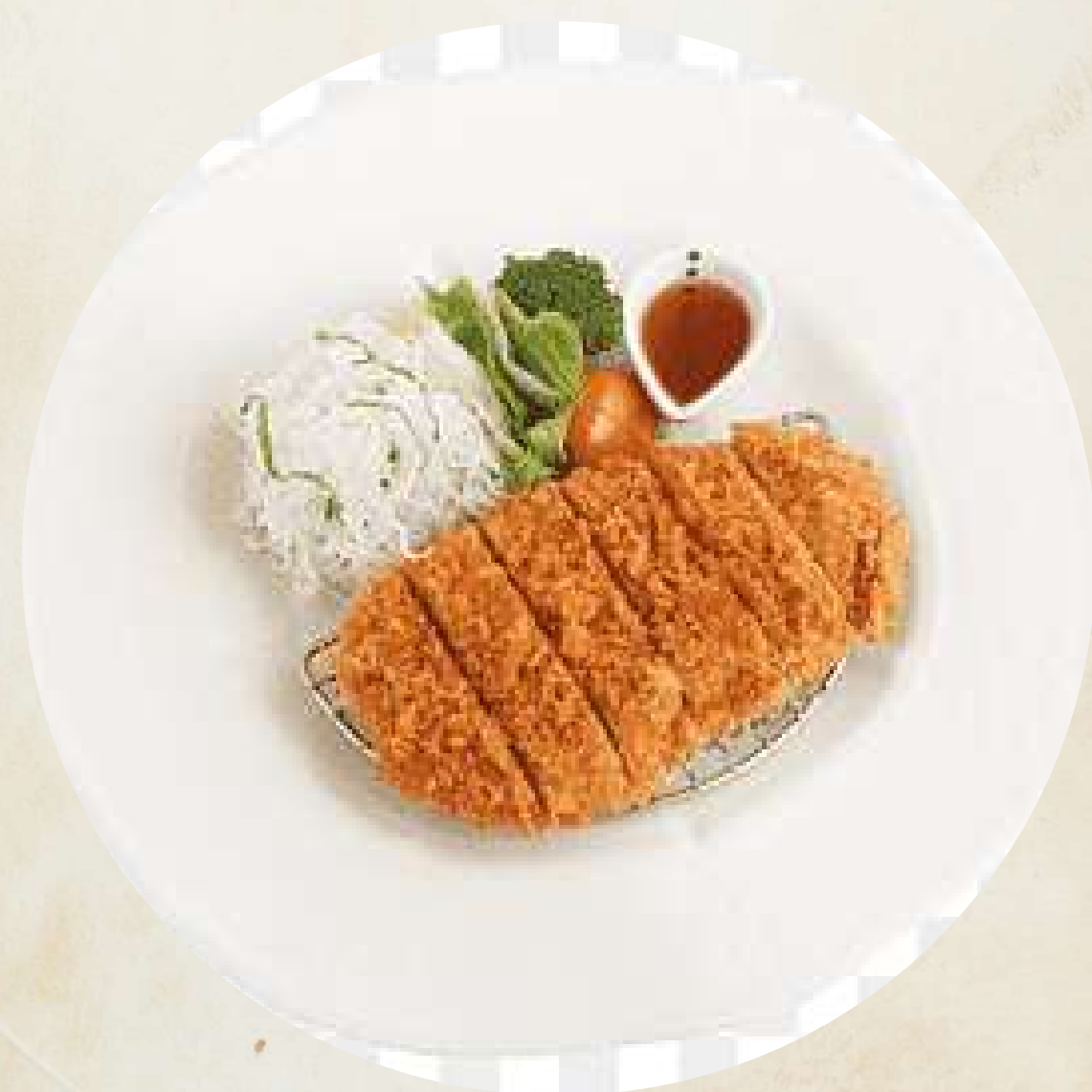
Pork cutlet katsu