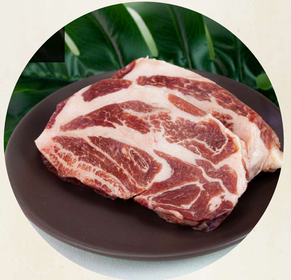
pork neck BBQ 200g

Salad, garlic, chilli and soybean sauce included