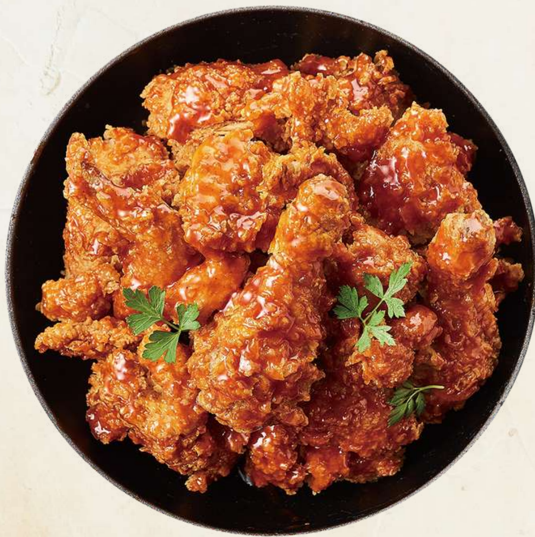
Korean fried chicken with