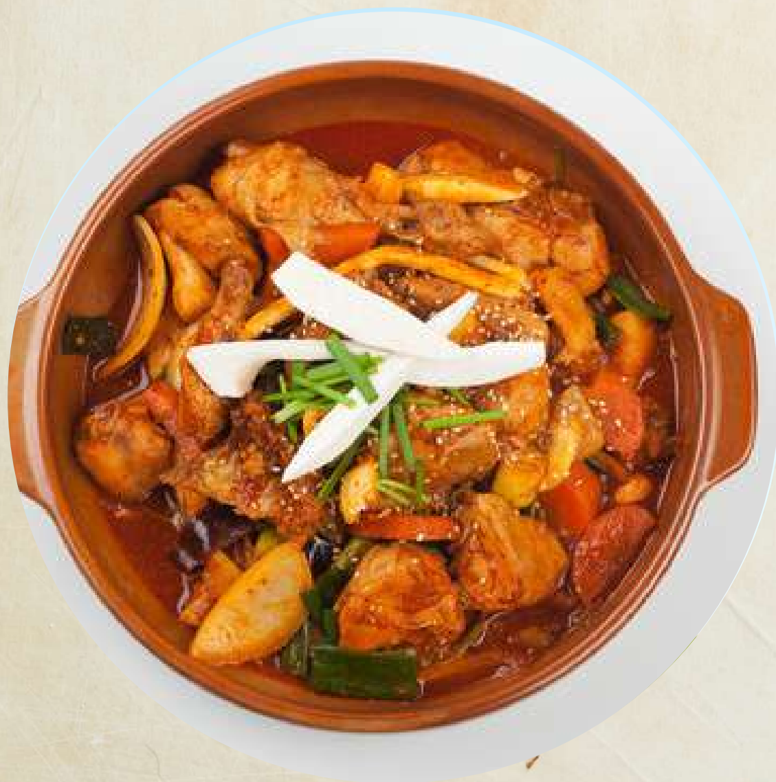
Spicy braised chicken