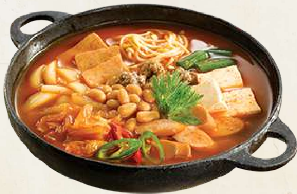
Korean Army Stew 부대찌개