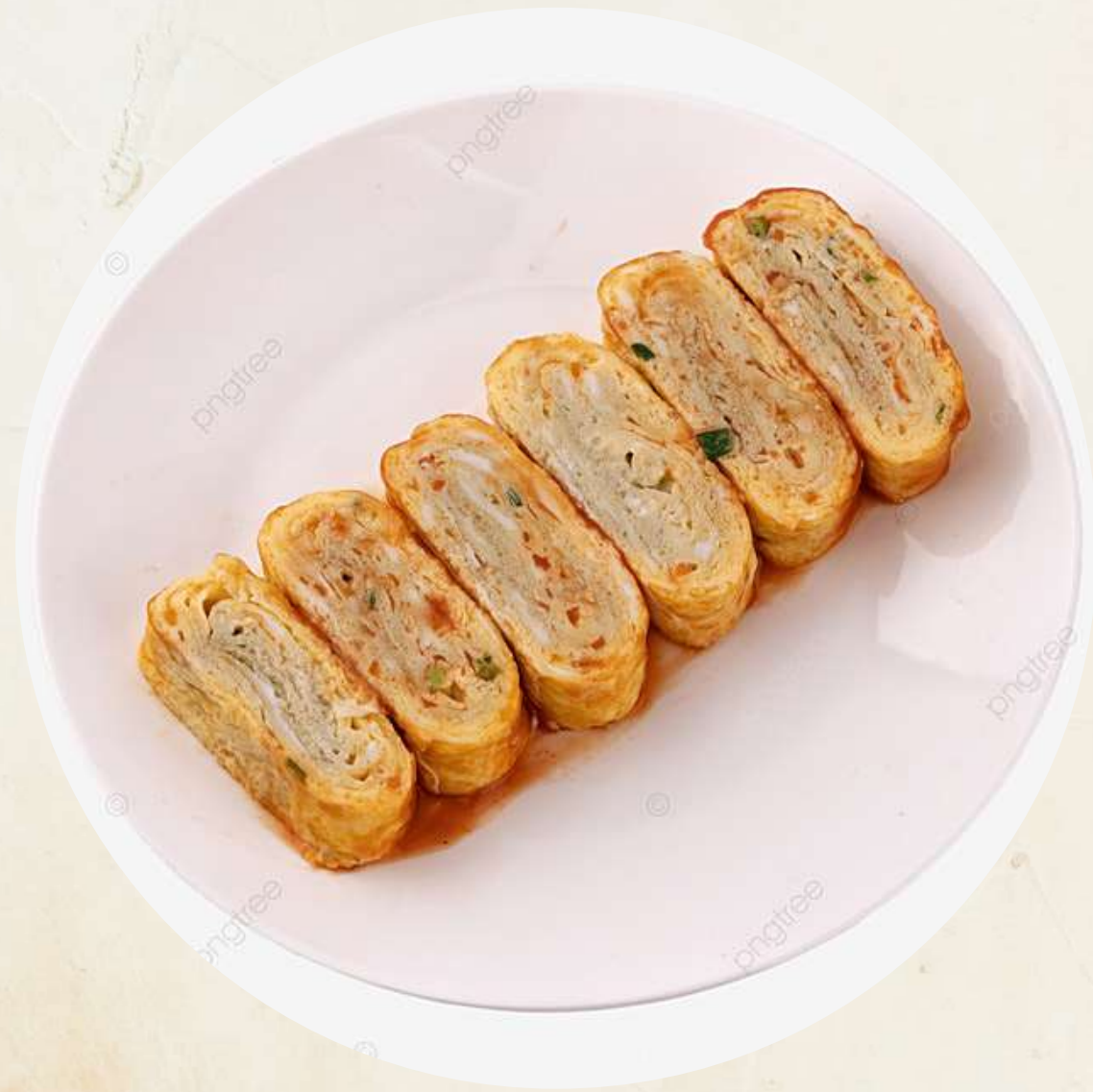
Korean Egg roll