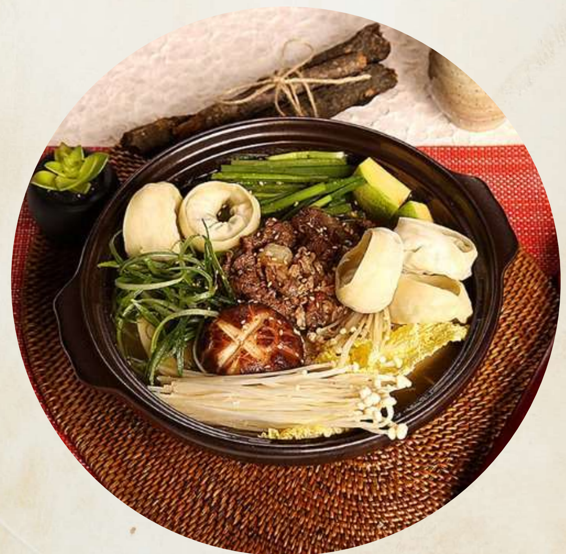
Beef dumpling hot pot 소고기만두전골