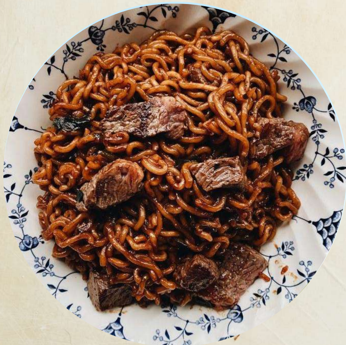
Black bean noodles with beef chunks