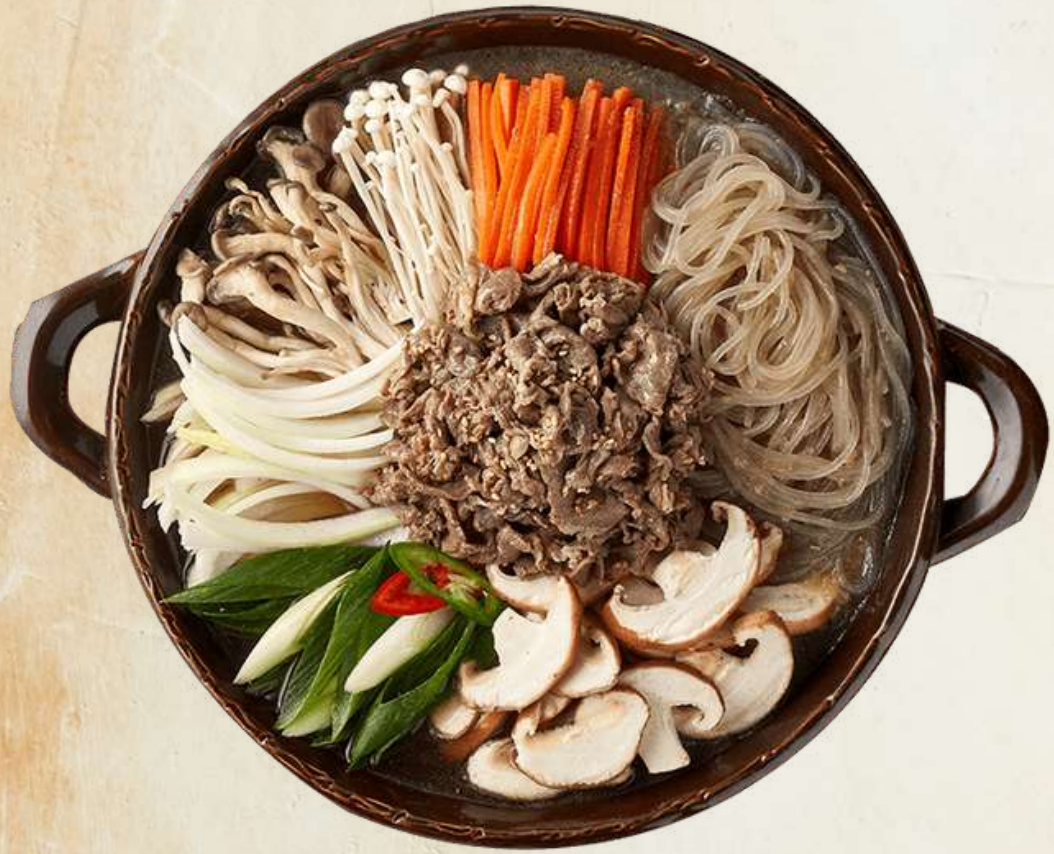
Bulgogi Hot Pot 불고기전골