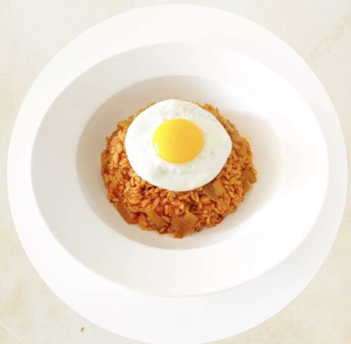
Kimchi fried rice