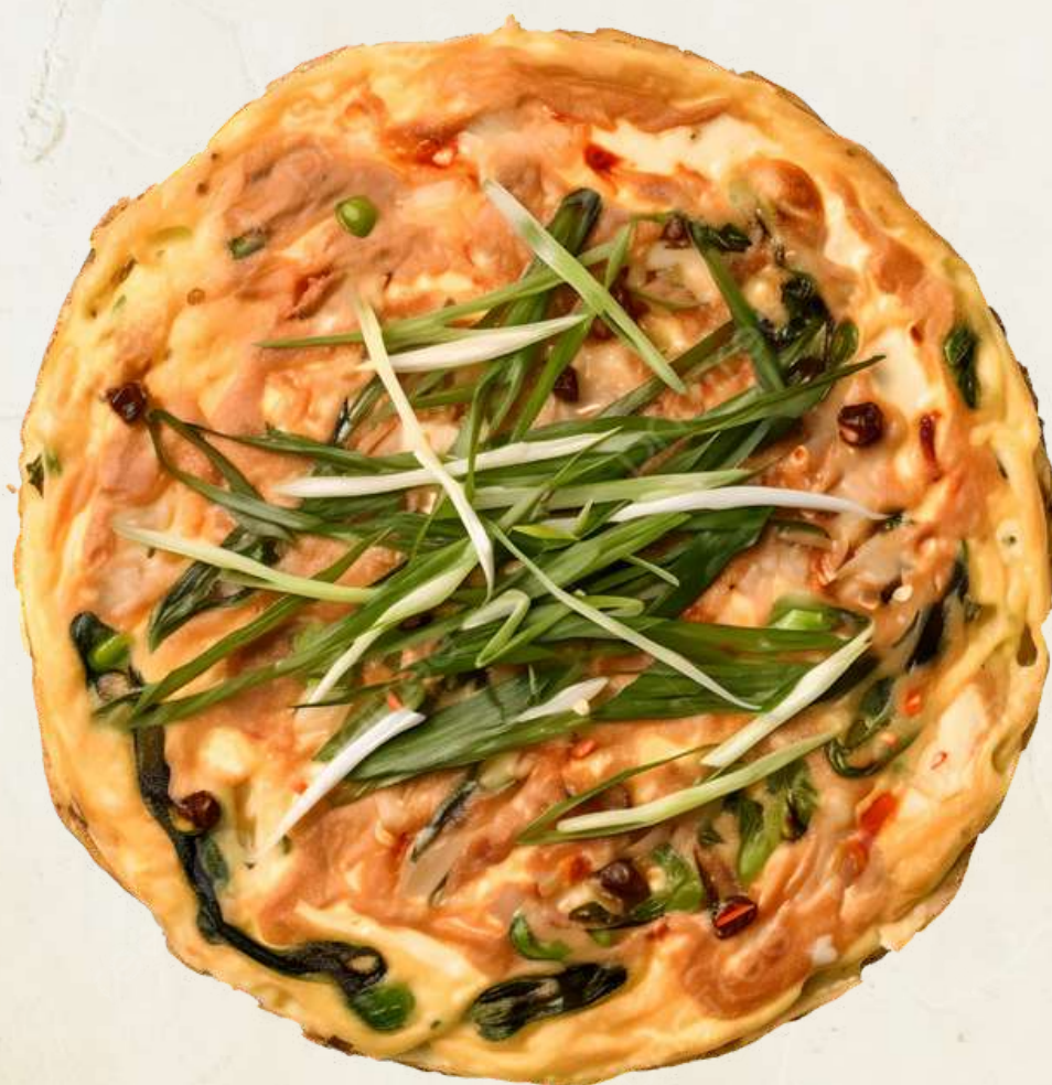
Korean seafood & green