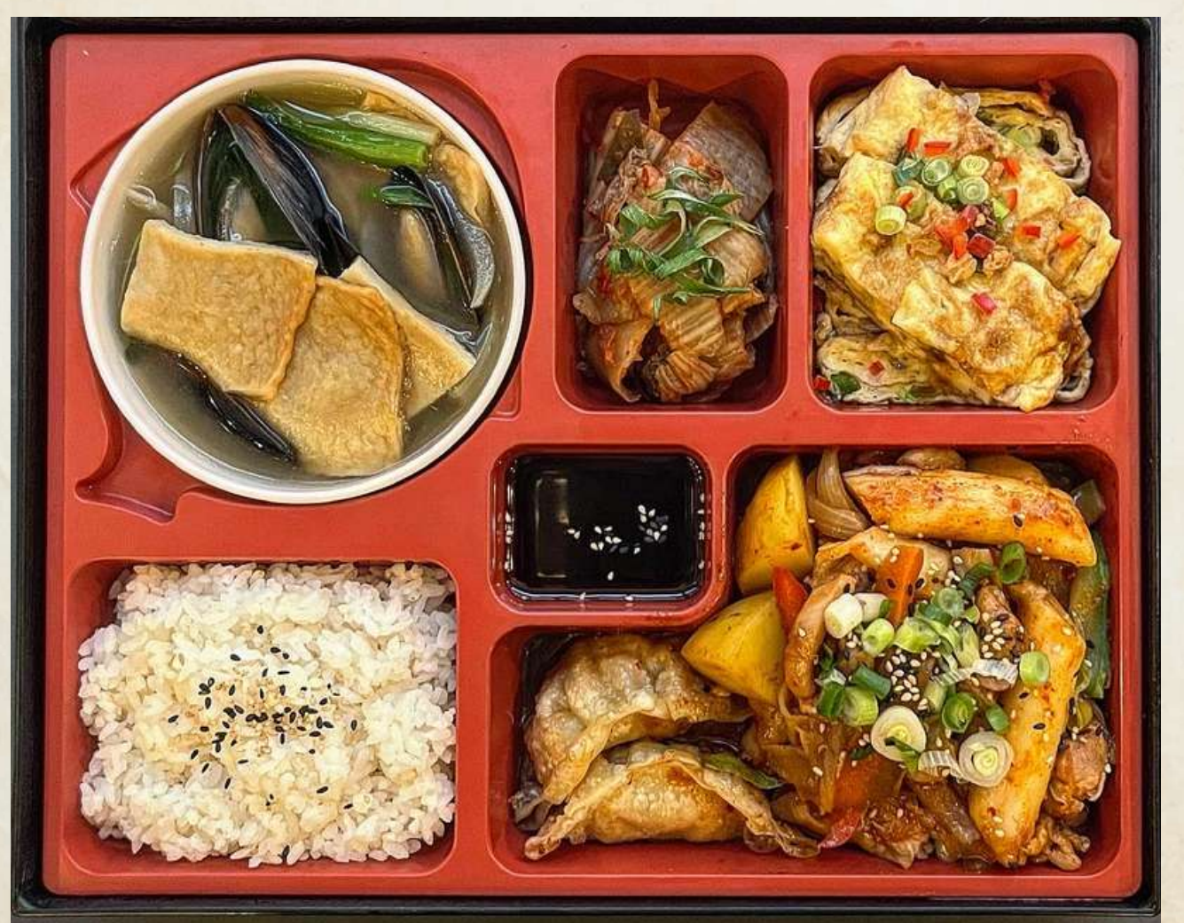
Spicy chicken box