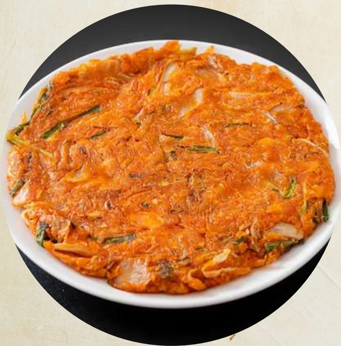
Korean kimchi pizza