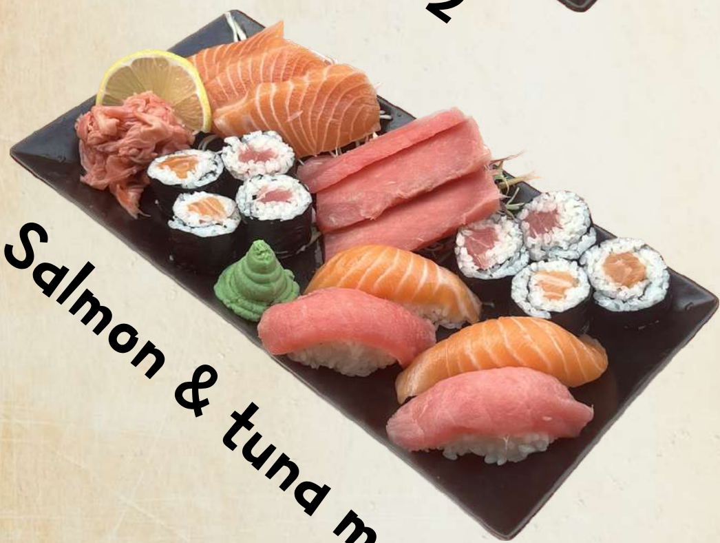
Salmon & tuna menu